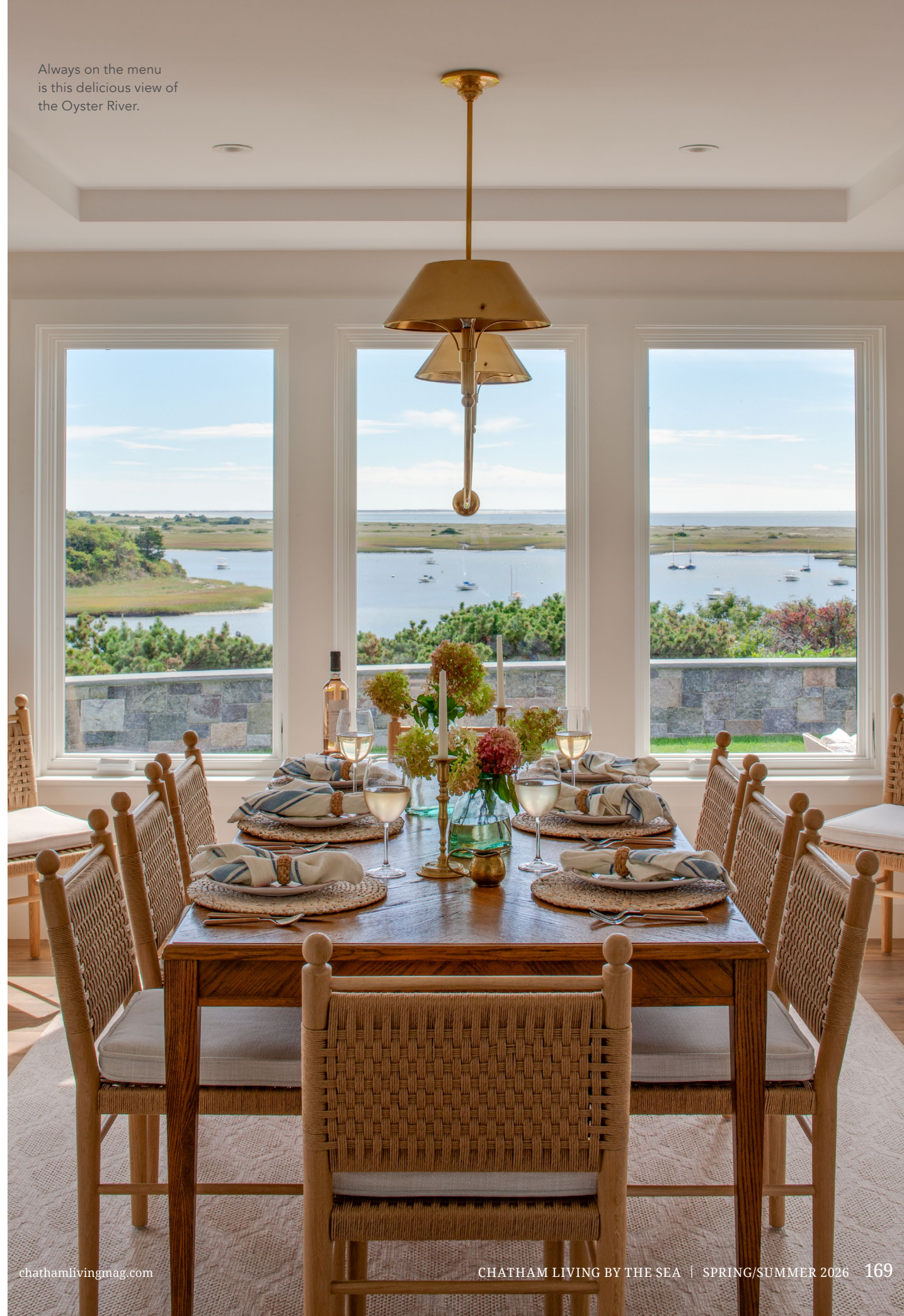
Always on the menu is this delicious view of the Oyster River.