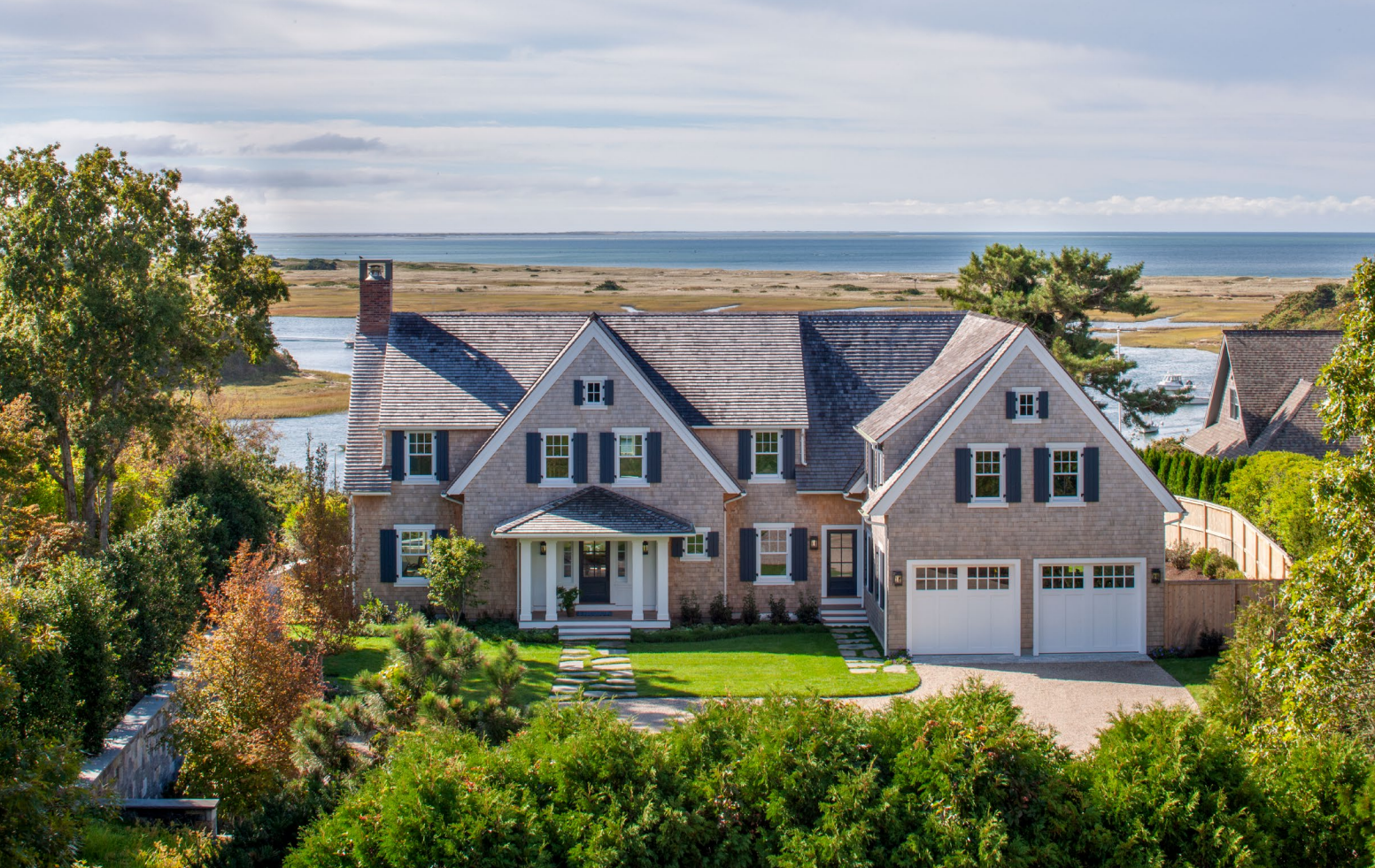
Above: With its traditional cottage facade and back open to the water, the house, says architect Sharon DaSilva, “has a split personality.” Below: The mudroom porch’s cedar v-groove board cladding creates a small exterior room with a view.

E dged by salt marshes, tidal flats and low dunes, this bluff soaring above the Oyster River offers a serene counterpoint to Chatham’s bustling harbors. Still, the waterway hums with life: quahog boats, charter fishing vessels, pleasure craft and kayaks crisscross the water, providing a constantly shifting tableau. Nearby residents—living in a mix of historic cottages and substantial waterfront estates—take quiet pleasure in watching the activity unfold.