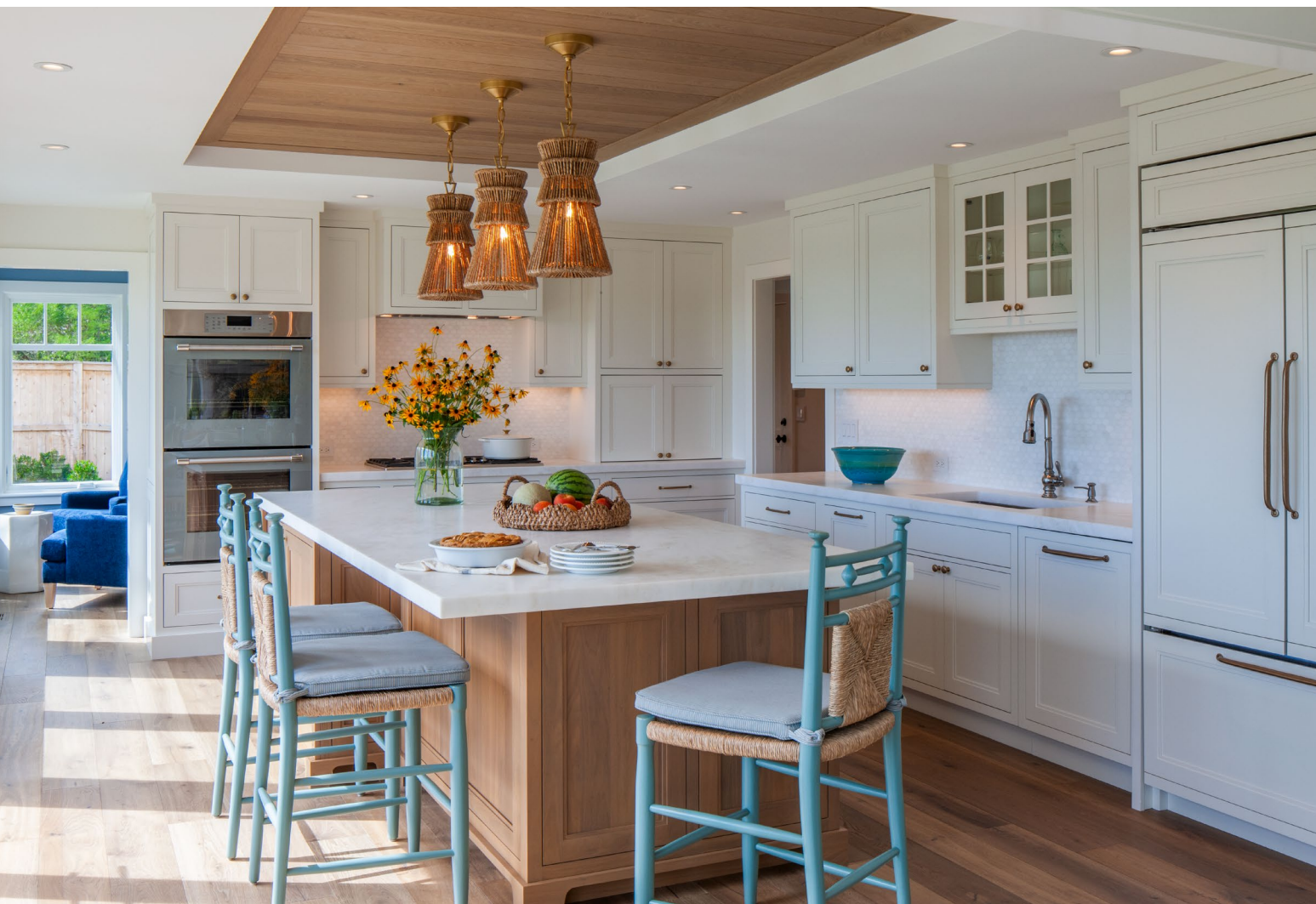
Using wood for the island and tray ceiling adds warmth to the kitchen's neutral palette.

four-bedroom, four-bathroom home presents a familiar, traditional façade from the street. The surprise comes at the back, where the house opens fully to the water views. Here, “it’s all about windows and doors and glass,” says DaSilva. “It’s definitely a house with a split personality, but it does what we intended.”